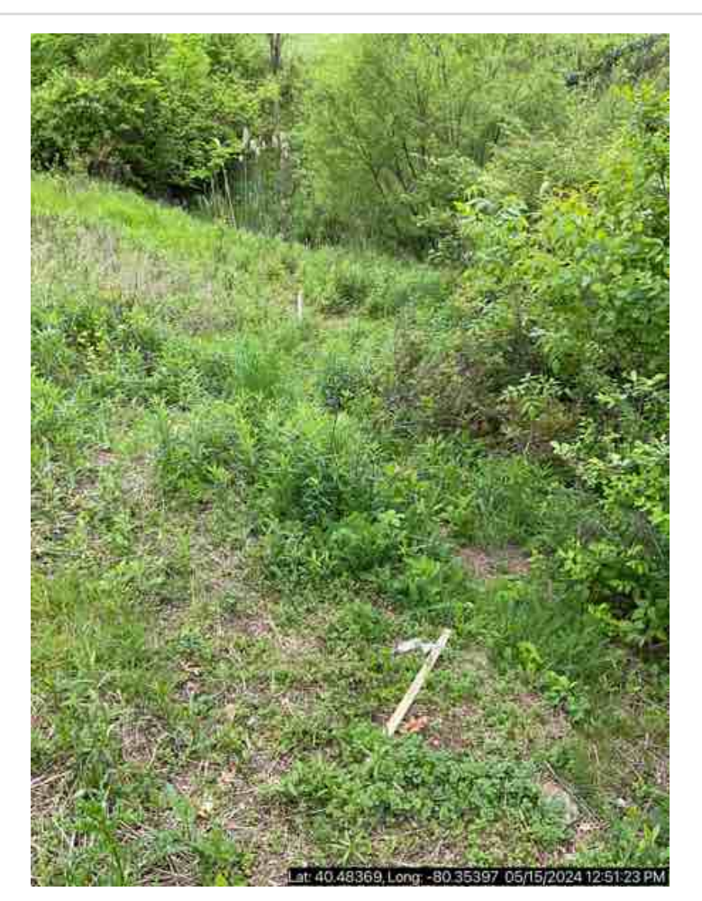
DCP-4 in foreground, DCP-3 further away